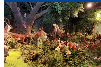
Visit to the Amazing Creation Museum!