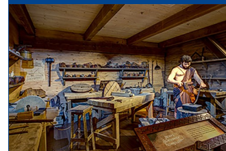
View from Inside the Ark Encounter

Day 5: Today, after enjoying a Continental Breakfast, you depart for home... a perfect time to chat with your friends about all the fun things you've done, the great sights you've seen and where your next group trip will take you!