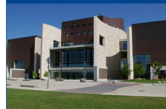
Visit to the National Underground Railroad Freedom Center

$75 Due Upon Signing. *Price per person, based on double occupancy. Add $223 for single occupancy. Final Payment Due: 1/17/2025