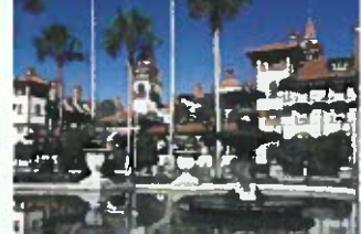
St. Augustine, our Nation's Oldest City

Day 3: Today, after enjoying a Continental Breakfast, you'll take a Guided Tour of charming St. Augustine, America's 1st city. Next, you'll browse the shoppes on historic St. George Street. Then, you will take a visit to the famous "Fountain of Youth." Later, you'll depart for home... a perfect time to chat with your friends about all the fun things you've done, the great sights you've seen and where your next group trip will take you!