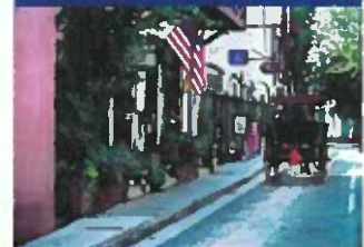
Historic St. George St