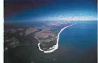
Aerial view of Amelia Island

$75 Due Upon Signing. *Price per person, based on double occupancy. Add $90 for single occupancy. Final Payment Due: 1/18/2020