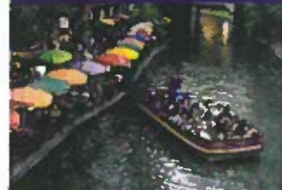
Relax on a cruise at the famous River Walk