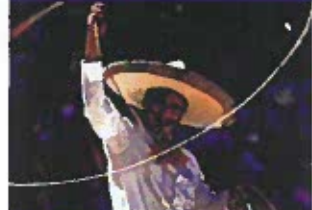
Enjoy the sights and sounds of San Antonio

$75 Due Upon Signing. *Price per person, based on double occupancy. Add $265 for single occupancy. Final Payment Due: 1/2/2019