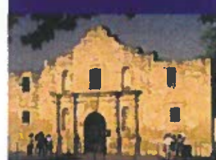
Stand where history took place at the Alamo

Day 8: Today, after enjoying a Continental Breakfast, you will depart for home... a perfect time to chat with your friends about all the fun things you've done, the great sights you've seen, and where your next group trip will take you!