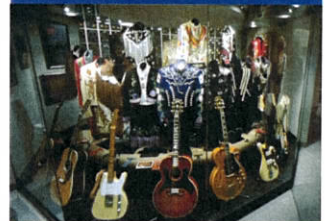
Country Music Hall of Fame.