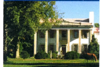
Belle Meade Plantation.