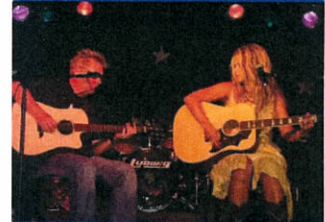
Nashville Nightlife Dinner Theater.