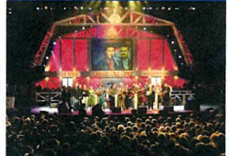
Famous Grand Ole Opry.

Departure: 2522 Capital Cir NE, Tallahassee, FL @ 8 am